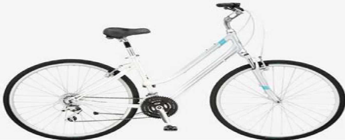
Silver / White