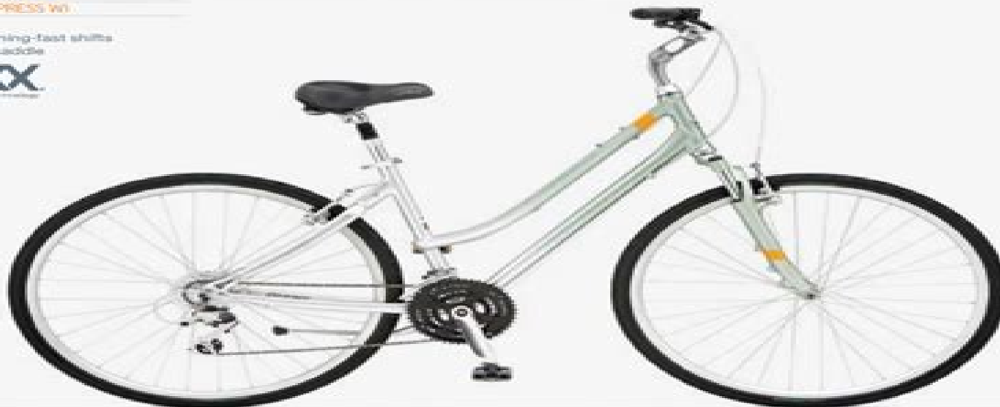
Light Green / Silver