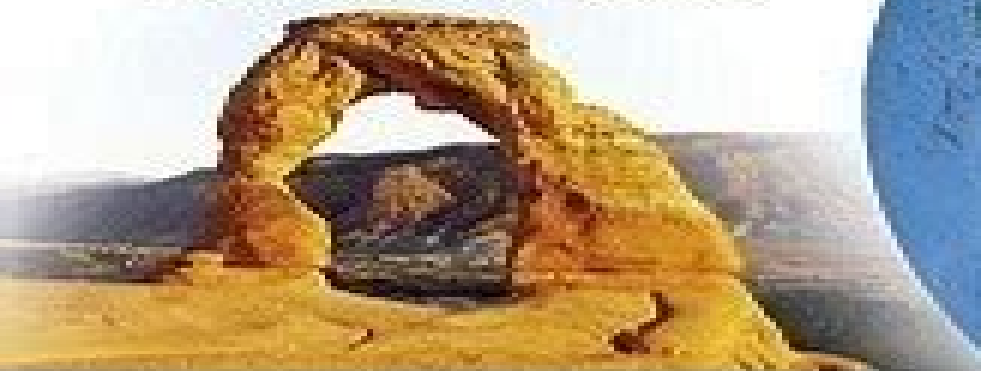
Climate ★ Environment