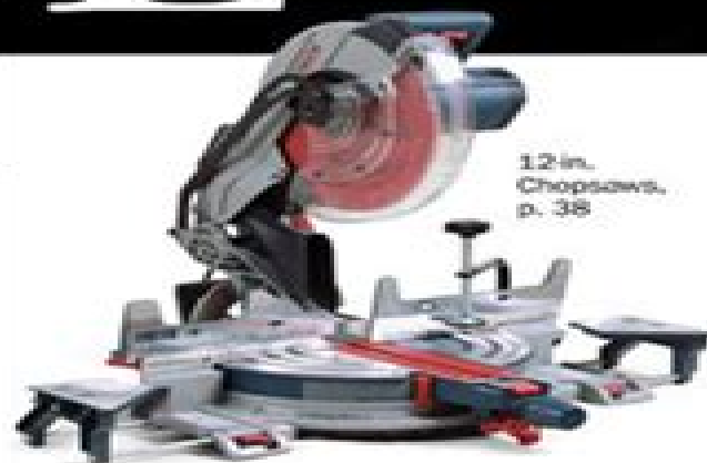
12-in. Chopsaws, p. 38