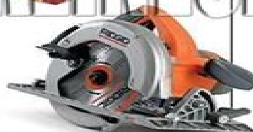
Circular saws, p. 30