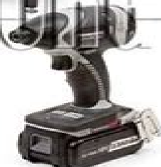
Impact drivers, p. 28