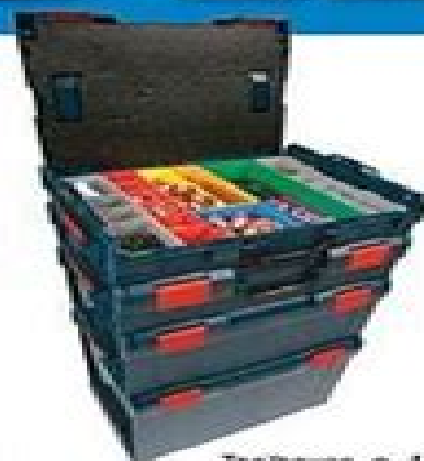
Toolboxes, p. 102