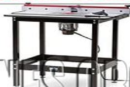
Router table, p. 97