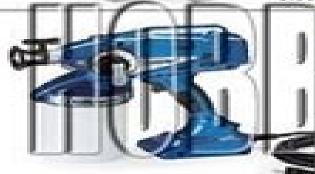
Finish sprayers, p. 86