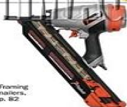
Framing nailers, p. 82