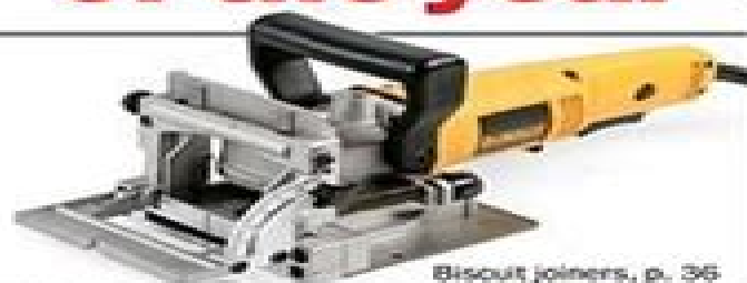
Biscuit joiners, p. 36